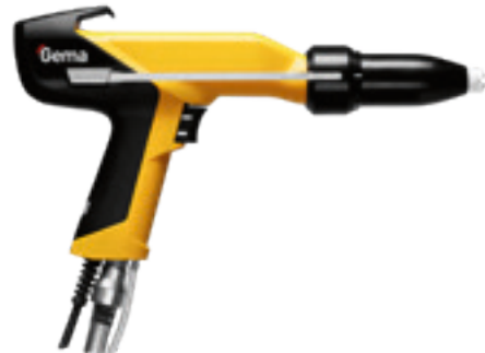
OptiSelect Pro with SuperCorona