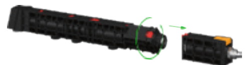
Tool-less and fastest access to all wear parts

Your global partner for high quality powder coating