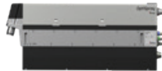
OptiSpray (AP02) application pump