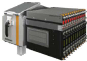
OptiSpray All-in-One integration to a OptiSpeeder (powder hopper) of an OC10

OptiSpray All-in-One and OptiSpray application pumps equip as standard the All-in-One OptiCenters (powder management center), providing flexibility and best coating results.