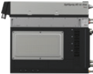
OptiSpray All-in-One (CG26-CP) merges powder feed technology and electrostatic control in one device

The pump's unique single-chamber system ensures gentle powder flow, consistent coating results and substantial powder savings.