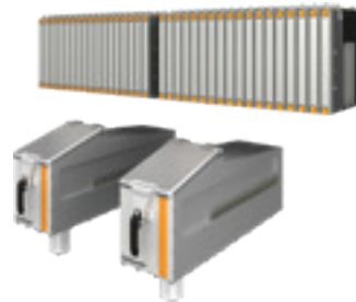
OptiSpray All-in-One integration to both OptiSpeeders of an OC11 (DualSpeeder technology)